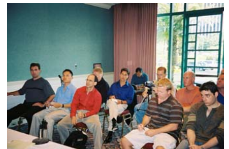
Pizza and Beer Outfit Feedback

Ever wish you could read the mind of a young, beautiful woman? Imagine the incredible opportunity when offered open, honest, revealing answers to your specific dating, mating, and relationship questions. Our very own Titanium Babes reveal their likes, dislikes, and inner most secrets during this extremely popular, question and answer, panel-style, open forum.