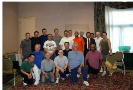
19 MEN OF STEEL BALLS

Women automatically judge and dismiss men from across the room; way before we have a chance to get near them. You will learn the 12x12x12 Rule and how to be the man she notices through your appearance, your walk, your introduction and your talk.