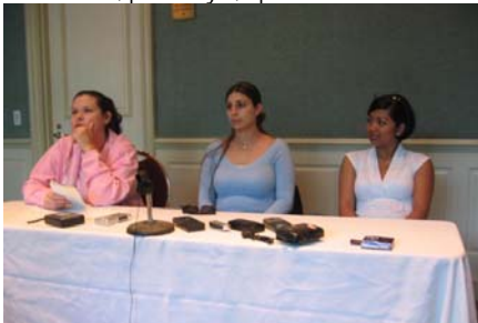
Ask us anything! Any damn thing!

Ever wish you could read the mind of a young, beautiful woman? Imagine the incredible opportunity when offered open, honest, revealing answers to your specific dating, mating, and relationship questions. Our very own Titanium Babes reveal their likes, dislikes, and inner most secrets during this extremely popular, question and answer, panel-style, open forum.